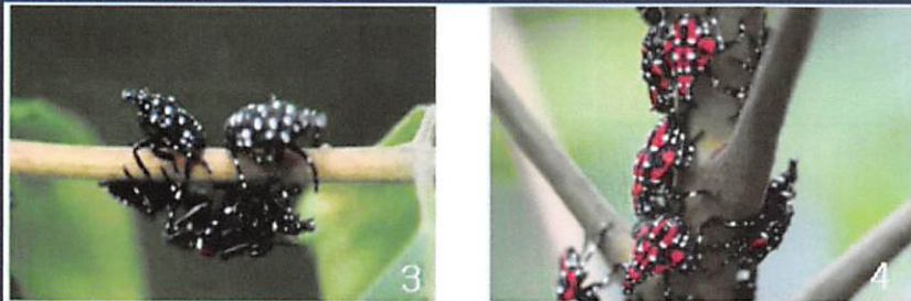
Spotted Lanternfly nymphs, present in spring and summer months. (Images from Park et al. 2009)

By signing this checklist, I am confirming that I have inspected my vehicle and those items I am moving from the Spotted Lanternfly quarantine area, and do not see any egg masses or insects in or on anything I am moving.